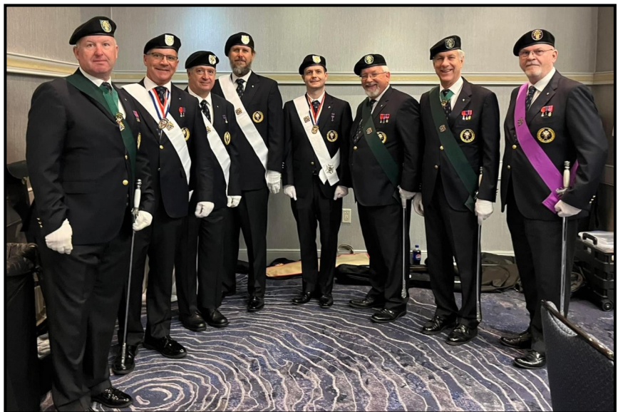
Honor Guard for Mass at State Meeting